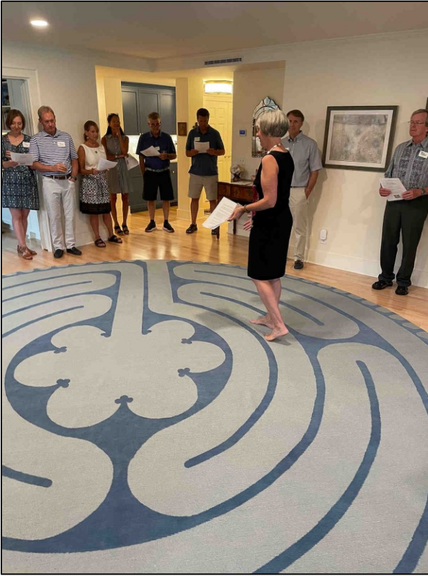
The author explaining labyrinth prayer at the dedication service

To your open mouth we come, pausing with expectancy. Posing questions, praying dreams, gath'ring courage, hope and faith, Circle, you hold life indeed. With thanksgiving we proceed.