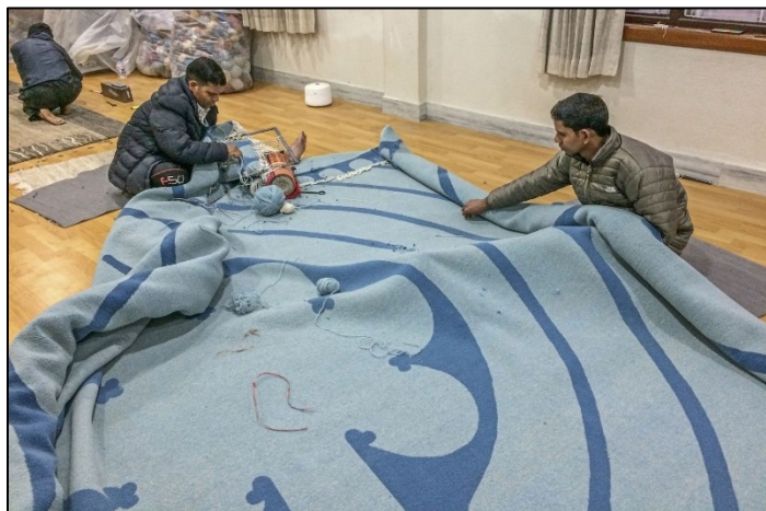
Weaving on the floor in Nepal

A rug-making firm in Nepal was recommended to us. They agreed to create a circular wool carpet using a loop and pile technique. The weavers were unfamiliar with labyrinths but assured us that they could copy the design that we had sent. After considering many colors that would harmonize with the environment outside the windows of the chapel and the interior of our home, we chose a light blue with neutral cream accents for the pathways and a darker blue for the rest of the labyrinth.