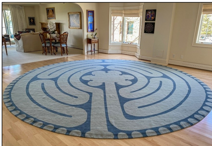
The Hope Haven West Chapel Labyrinth