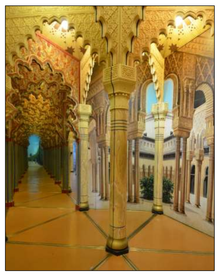
The mirror maze at the Gletschergarten, Lucerne, Switzerland. Originally constructed for the 1896 Swiss National Exhibition in Geneva, the maze was subsequently moved to the Metropol in Zurich and then reassembled in 1899 at the Gletschergarten, where it remains to this day. Photo: Jeff Saward, November 2015