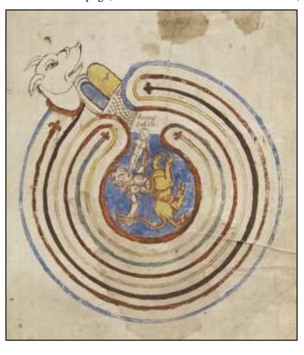
9th century labyrinth manuscript Photo: courtesy Bibliothèque Nationale de France, Paris; BNF Latin 4416, folio 35

the presence or absence of a lock, and the nature of the centre and its relationship to the entrance. Clearly the doors in these labyrinths can be used to help the viewer understand what the labyrinth illustrates.