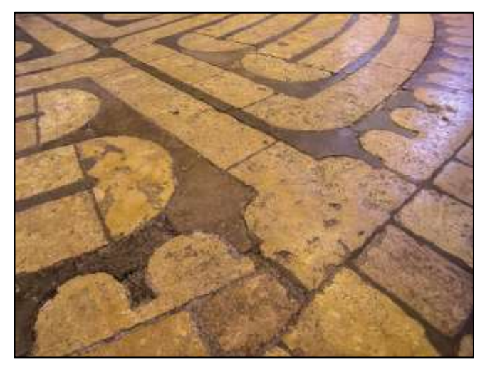
Entering the Chartres Cathedral labyrinth.

Before concluding this article with implications for contemporary labyrinth use, we will briefly explore one particular medieval labyrinth "door" that is of interest to many readers of this journal. The passageway into the labyrinth at the Chartres Cathedral is notable. Like many other cathedral labyrinths from the same period, this labyrinth is found in the nave, not far from the western portal, and would have been encountered as worshippers made their way east toward those areas of the church considered more sacred. It is placed on the threshold of the previous cathedral.<sup>75</sup> While the meaning of this is undocumented, it seems intentional, note-worthy, and related to the concept of entrance.