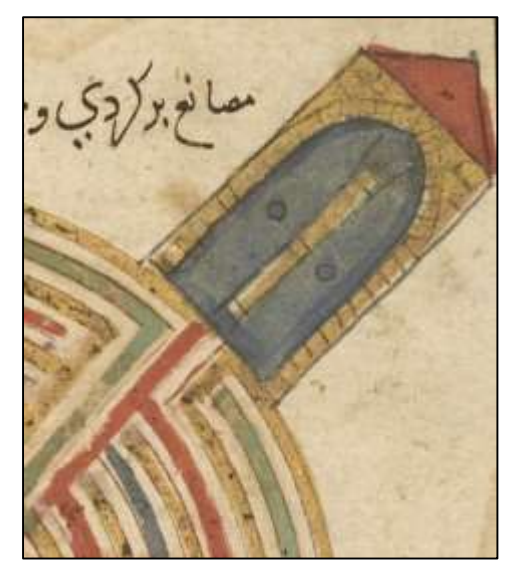
Heidelberg MS Persian Cod. Heid. Orient. 118, folio 197.<sup>35</sup>