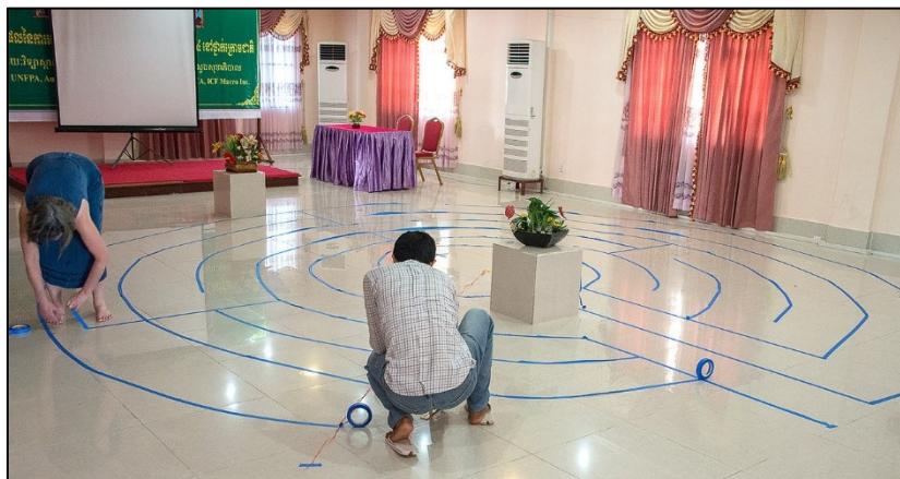
Placing the masking tape labyrinth on the tiled floor of a meeting room

In 2016 I returned to help with a leadership event in a different region of Cambodia. The planning team had carefully chosen a site with room for a labyrinth, but space was limited. We installed a labyrinth using the inner five circuits of the Chartres pattern. My co-creator was one of the same men who had built the labyrinth in 2014, so we were able to construct the masking tape labyrinth in about an hour.