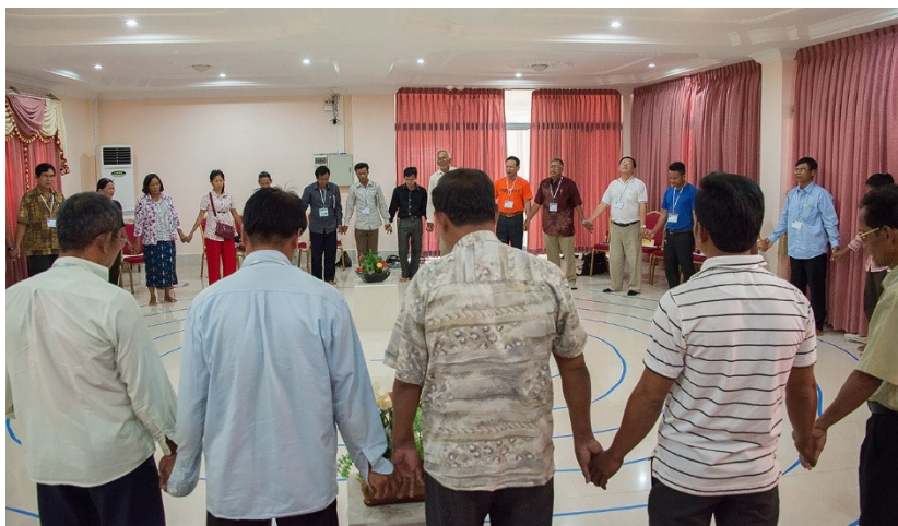
Closing prayer after a labyrinth walk and debriefing

Ninety percent of the participants reported experiencing God in a very meaningful way during their labyrinth walks. Two questions on the evaluations brought this out, “What did you experience this week that you value most?” and an empty space asking for additional comments after a rating (very satisfied, satisfied, partly satisfied, not satisfied or not applicable) of the spiritual practices included in the workshop, including labyrinth prayer. When submitting a final report, the Cambodian leadership committee also mentioned that “participants were touched deeply and realized they were having an experience with the Holy Spirit when they walked the labyrinth,” “Many reported having inner peace deep in their hearts as they walked closely with God on the labyrinth,” and “Many expressed in writing that they were able to seek God’s presence through their labyrinth experience.”