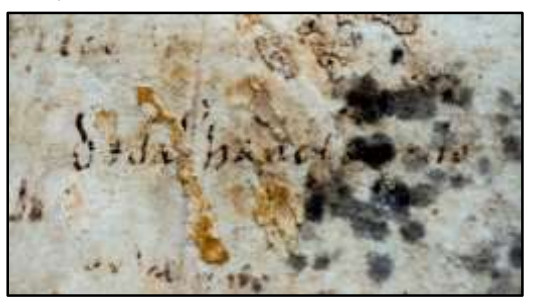
Figure 2: text at top right of page

A centaur appears in the centre of the labyrinth. It has the lower body of a four-legged horse-like animal and the upper body and head of a human. A decorative "belt" circles the animal body where it joins the human torso. Many examples of this type of decoration can be found on the bodies of depictions of Sagittarius in various medieval manuscripts. Two roundish forms, most likely representing breasts, are visible on the upper torso.<sup>35</sup> A tail appears to rise off the centaur's back haunch;<sup>36</sup> part of it no longer exists, so it is hard to make out the exact nature of the appendage.<sup>37</sup>