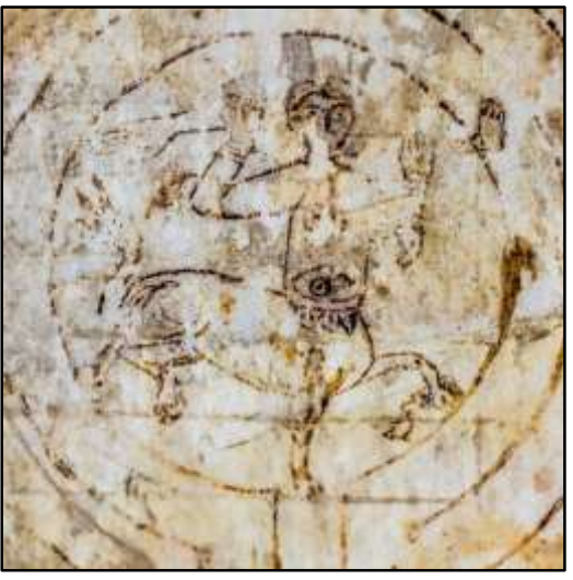
Figure 3: the central centaur

The four hooves of the centaur seem placed to communicate a sense of presence and power. The back right and front left hooves touch the circle's edge on opposite sides, about one fifth of the way up from the bottom. The front right split hoof is placed in the centre of the path that leads to and from the centre directly, as if to block it.<sup>38</sup> Under the centaur's right hoof is the disembodied and bearded head of a man whose face points in the direction of the centaur's body.<sup>39</sup>