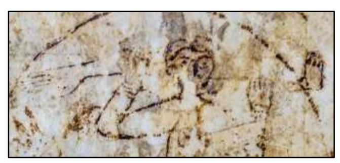
Fig. 4: the centaur's belly