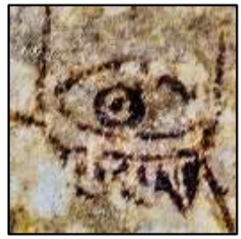
Fig. 5: the centaur's meal

An all-powerful malevolent creature reigns in the centre of this manuscript labyrinth. He clearly has the ability to destroy and dismember, all the while coolly maintaining a direct gaze at onlookers. The centaur, filling most of the central space, faces the reader, as if looking directly at him or her. Both the creature's arms are raised almost to shoulder level, and are bent at a ninety-degree angle at the elbow, with both hands exposed. There are bracelet-like circles around each wrist.<sup>40</sup> The centaur's head extends almost to the circle's edge while his front right split hoof rests where the circular arc on the bottom passes the empty path space used for entering the centre. He appears to be holding and possibly eating a human arm and hand in his right hand; it too nearly touches the edge of the centre circle. In his left hand, the centaur holds the right leg and foot of a human being. The foot extends beyond the centre circle, reaching well into the pathway.