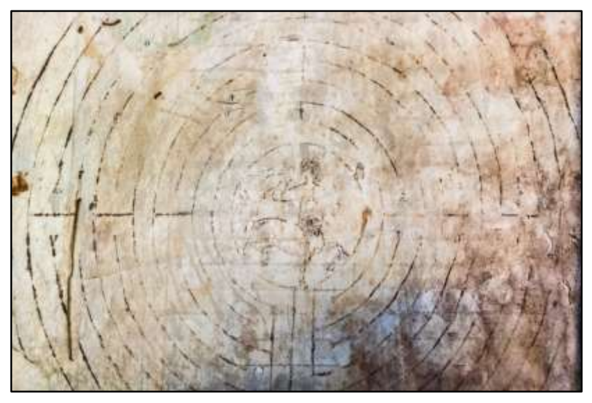
Figure 1: the Labyrinth and Minotaur depicted in Orléans Ms. 16

Orléans Ms. 16 contains a number of books from the Hebrew Bible: Proverbs, Songs of Songs, Job, 1 & 2 Maccabees, and Tobias. It includes nine large coloured, decorated letters with knot motifs.<sup>27</sup> Part of page 250 and all of page 251 include a variety of words, alphabets, and musical notations that were added in the eleventh to twelfth century.<sup>28</sup> Lessons read during the feast of the Birth of Mary<sup>29</sup> and the Feast of St. Benedict can also be found.<sup>30</sup> The labyrinth, found on the final page,<sup>31</sup> is considered part of the original manuscript (unlike the doodles and additions found on pages 250-251) and is thus dated to the 10<sup>th</sup> century.<sup>32</sup>